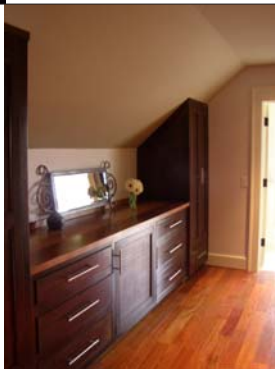
2nd Floor Dressing Area