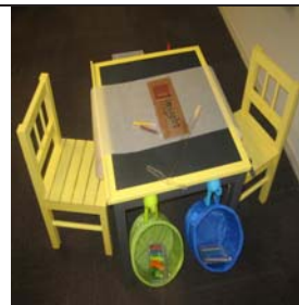
Table and Chair Set for the Creative Child